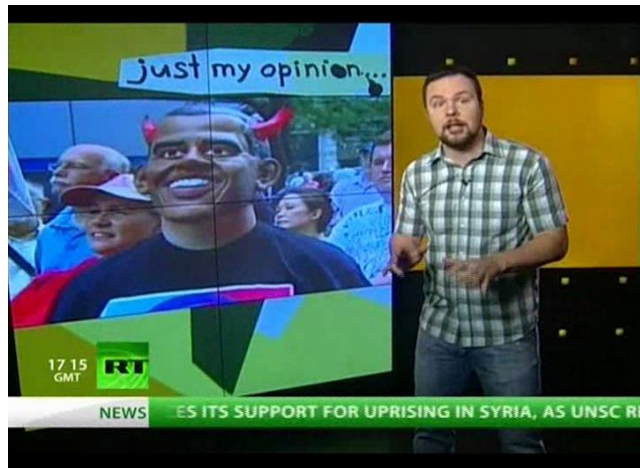
Messaging on RT prior to the US presidential election (RT, 3 November)