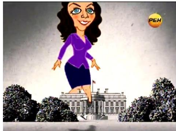
Simonyan steps over the White House in the introduction from her short-lived domestic show on REN TV (REN TV, 26 December 2011)