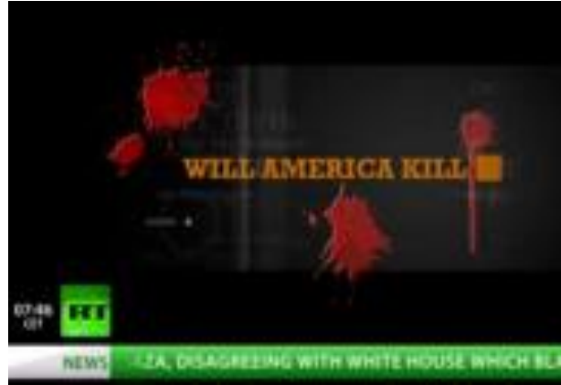
RT new show "Truthseeker" (RT, 11 November)