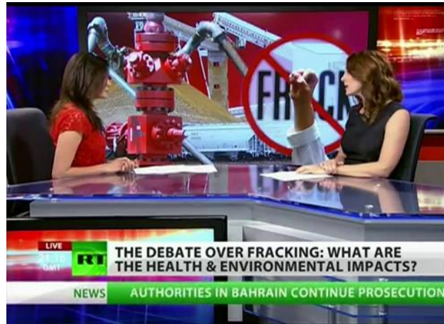
RT anti-fracking reporting (RT, 5 October)